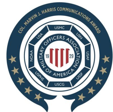
5 Star Harris Award Newsletter and Website