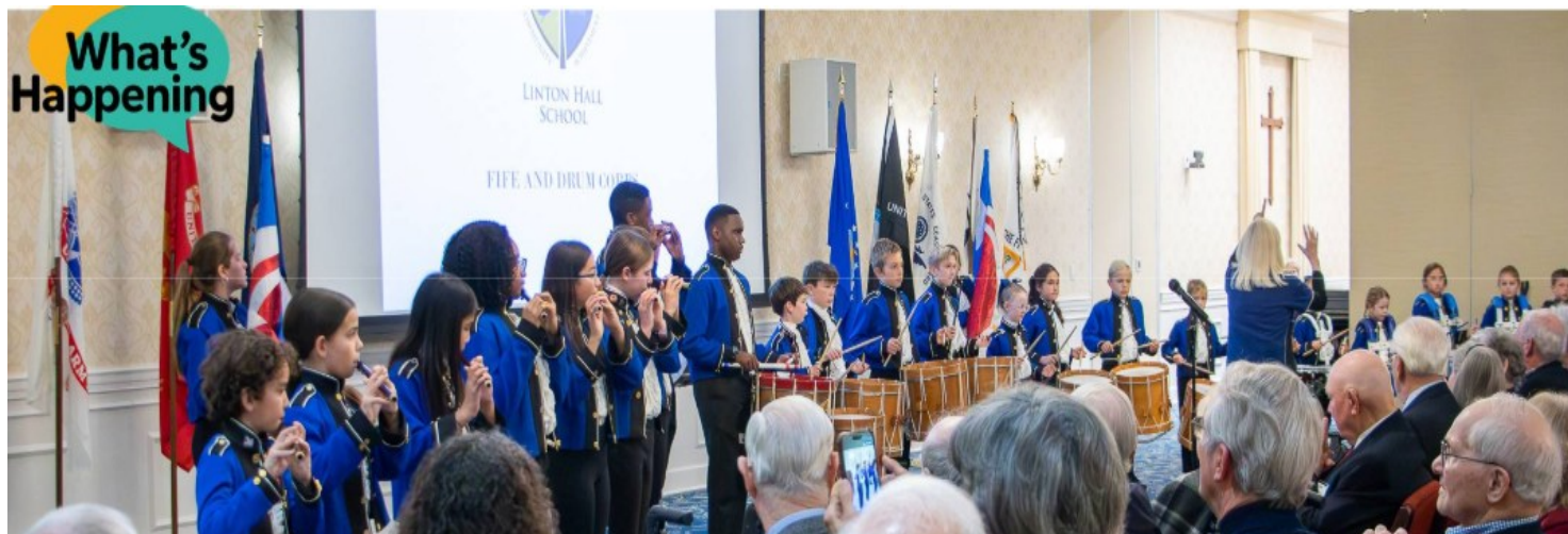
Linton Hall School Fife and Drum Corps performs for Falcons Landing Veterans Day event sponsored by the Falcons Landing Chapter of MOAA.

April 25, 2026 at 1300 hours in the Falcons Landing Ballroom